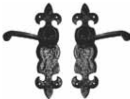
San Marino lift handle

Add a unique finish to your door with our line of decorative hardware.